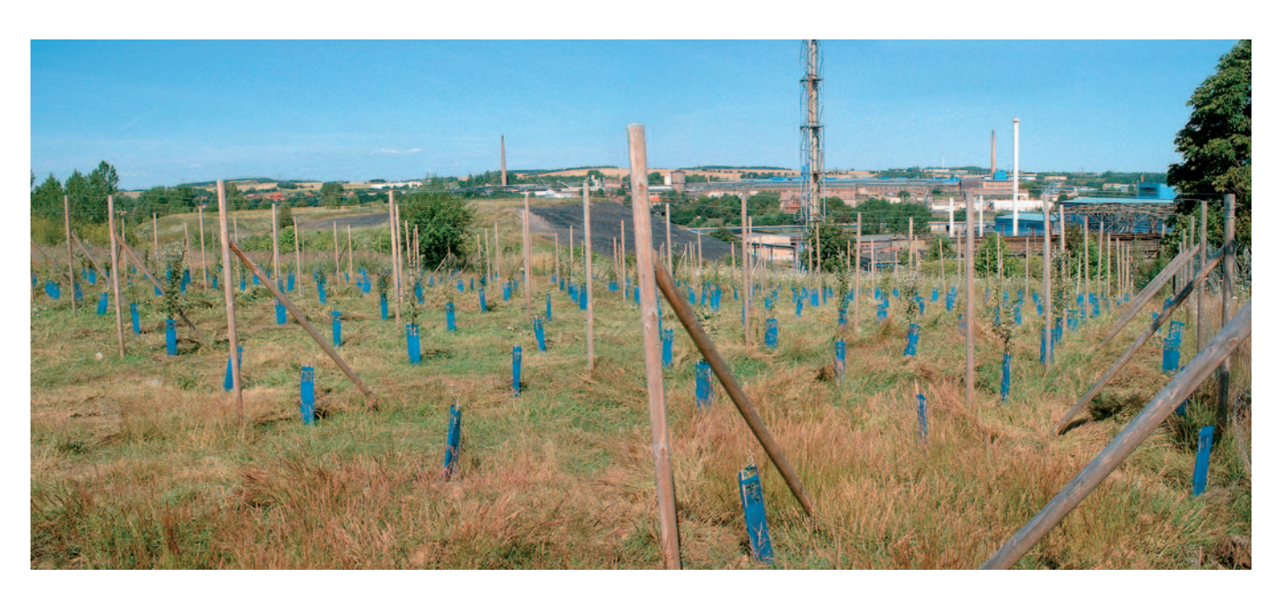
Fig 2 | Plantation with wild-type as well as transgenic poplars on a field site with high amounts of heavy metals in the soil, in the former copper mining area Mansfelder Land, Saxonia Anhalt, Germany.

'all-purpose performers' for phytoremediation in controlled greenhouse conditions: they showed a high potential for the uptake and detoxification of both heavy metals and pesticides (Peuke & Rennenberg, 2005). We are now conducting field trials with these poplars in former copper-mining regions with different levels of contamination and under different climatic conditions to measure their capacity to remove heavy metals from the soil (Fig 2). Further aims of the project are to assess the biosafety risk of transgenic poplars for the phytoremediation of soils by elucidating the stability of the transgene under field conditions and the possibility of horizontal gene transfer to microorganisms in the rhizosphere. Three field trials, each with low (control), middle and high amounts of heavy metals in the soil were set up in former mining areas in (Saxonia Anhalt, Germany district Mansfelder Land) and Russia (Middle Urals, Swerdlovsk oblast).